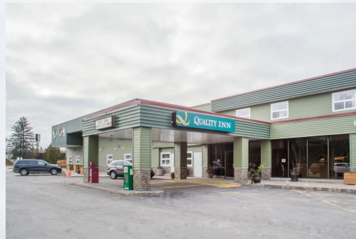
Quality Inn, Ecclestone Drive

Quality Inn 300 Ecclestone Drive Bracebridge, Ontario P1L 1X1